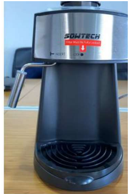
Recalled SOWTECH Espresso Mach